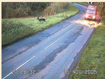
Above and below: Video surveillance is valuable in identifying deer behaviour and the effectiveness of accident reduction measures.