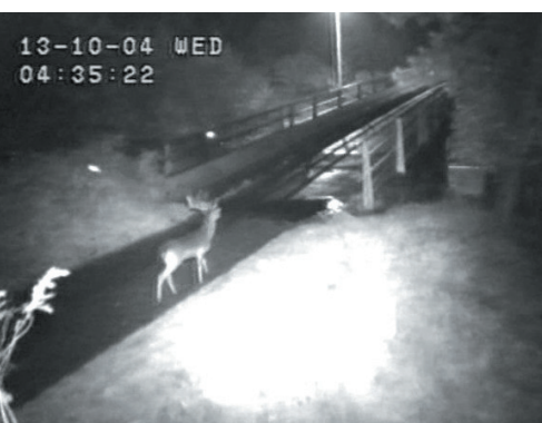
This deer was prepared to use a 4m wide bridge across the M25.

Trial sections with these devices were established at the end of last year on the B4506 at Ashridge Forest in the Chilterns supported by the Three Counties Traffic partnership (Hertfordshire, Buckinghamshire, Bedfordshire) and also on the A39 near the Quantock Hills by Somerset County Council. Two further trials with the Ecopillars will commence on two trunk roads (A38 in Devon and A49 in Herefordshire) this spring commissioned by the Highways Agency. To study their effectiveness, rather than merely waiting for reports of changes in accident statistics over future years, the local funding authorities are providing support to enable us to undertake behavioural monitoring of these trials using periods of day/night digital video surveillance, the latter being used to