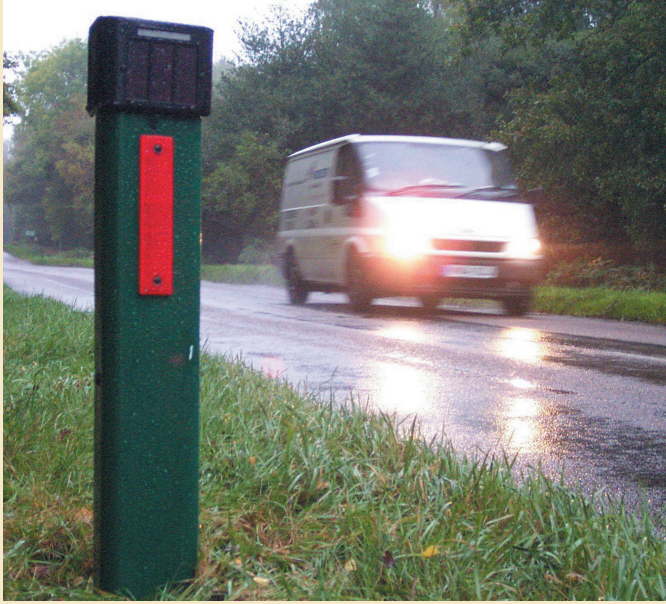
The Ecopillar incorporates acoustic signals and optical flashes from reflected headlights.