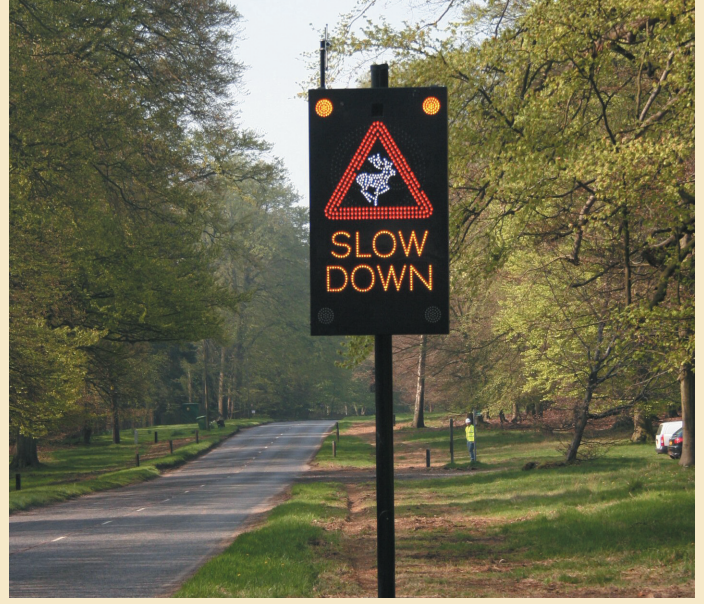
Interactive signage was deployed for the first time this year in Britain.

determine whether deer do actually tend to delay crossing longer after traffic has passed where such devices are present, and also whether any reaction elicited differs either between the devices on test and/or between our different common species of deer. A similar approach to monitoring is being utilised on the B1106 through Thetford Forest in Suffolk, where the County Council is interested in assessing whether rumble strips, in addition to potential reduction of driver speeds, may also have some effect in alerting deer to oncoming traffic 5 .