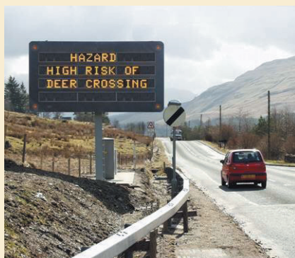
Variable messaging on the A835 in Scotland.

results of the work should also be available later this year.